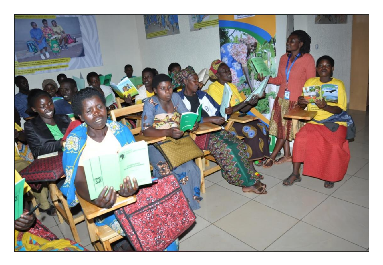
Figure 7: HoF staff with beneficiaries during reading session