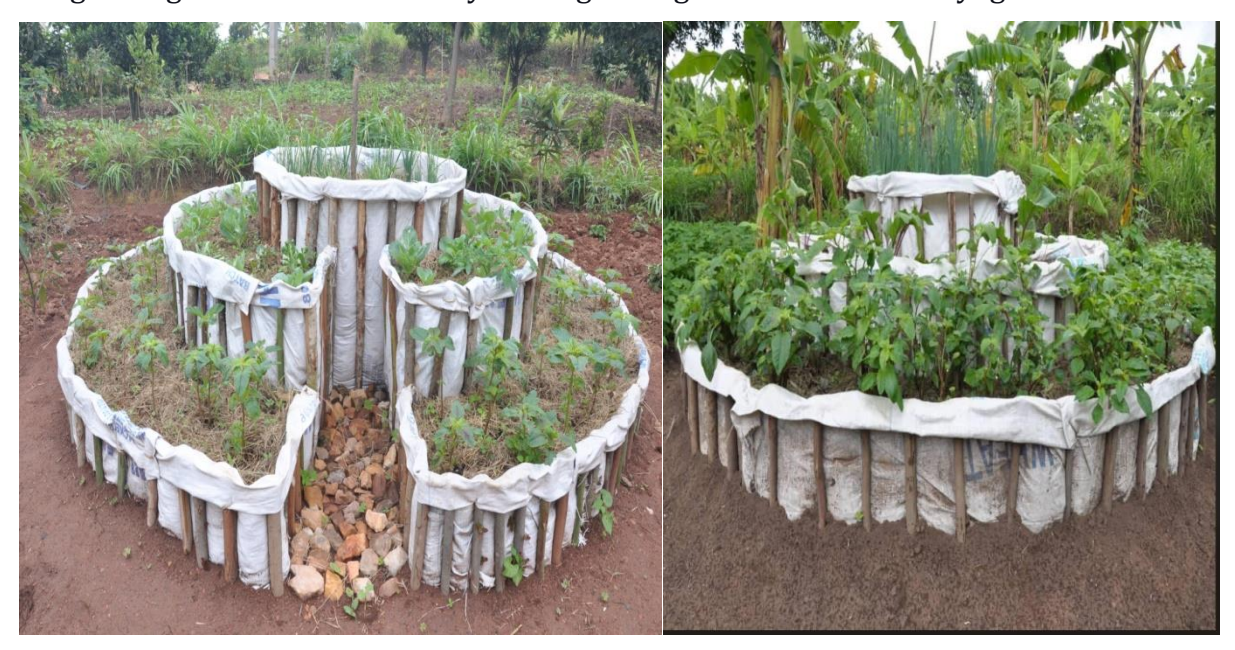
Figure 9: The kitchen garden constructed at family

HoF supported 62 families to construct the kitchen garden at their home for promoting a balanced diet and reducing malnutrition among children under five years old. The Kitchen gardens are very critical at family's level especially for improving balanced diet and protecting children from malnutrition. Each kitchen garden was constructed at each family and now kitchen garden constructed it is at production stage and families are enjoying well vegetables. The 59 families received support from Hope of Family and they are living in Songa village of Mbare cell and Nyakabingo village of Kinini cell in Shyogwe sector.