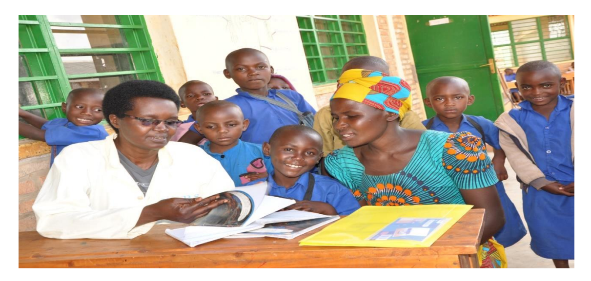
Figure 4: Parent visited her kid at Mbare Primary School