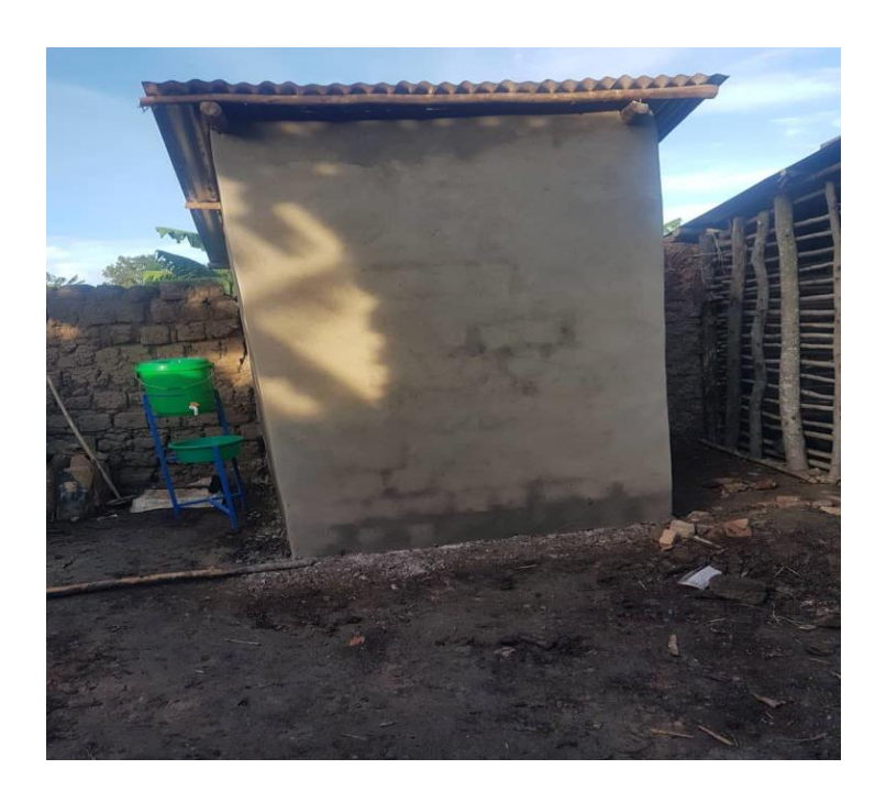
Figure 12: Family's modern toilets constructed

Hope of Family has supported 22 family's beneficiaries to construct modern toilets or latrines in their families in order to promote hygiene and sanitation culture at family level and 65 families received a support of iron sheets and doors for reconstructing their toilets at home.