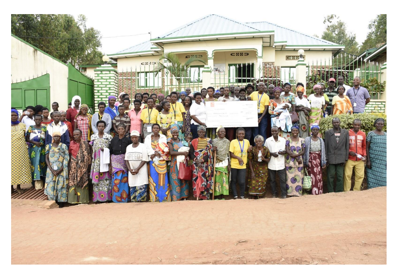
Figure 8:100 beneficiaries received long term project support