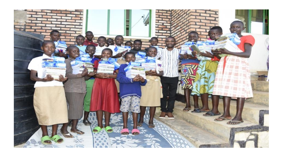
Figure 2: School materials packages distribution

materials packages and the ceremony happened at HoF office in the presence of HoF staff and local leaders.