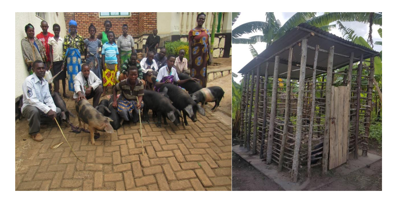
Figure 10: The distribution of pigs to families and piggeries constructed