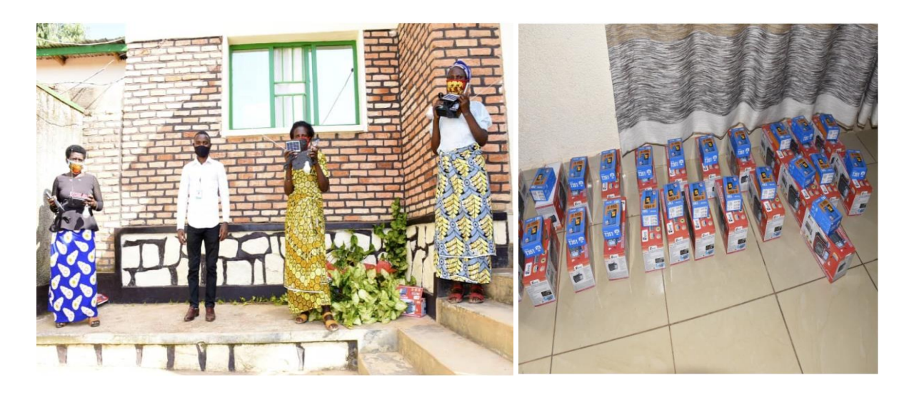
Figure 14: Distribution of Mobile Phones and Radios to Families

Hope of Family donated radios and mobile phones to 80 families to facilitate them have access to information as well as sharing daily updates among its beneficiaries. HoF also gave them solar power bank and home light. Now, radios and mobile phones are supporting children to follow lesson courses that are passing on radio program organized by Rwanda Education Board.