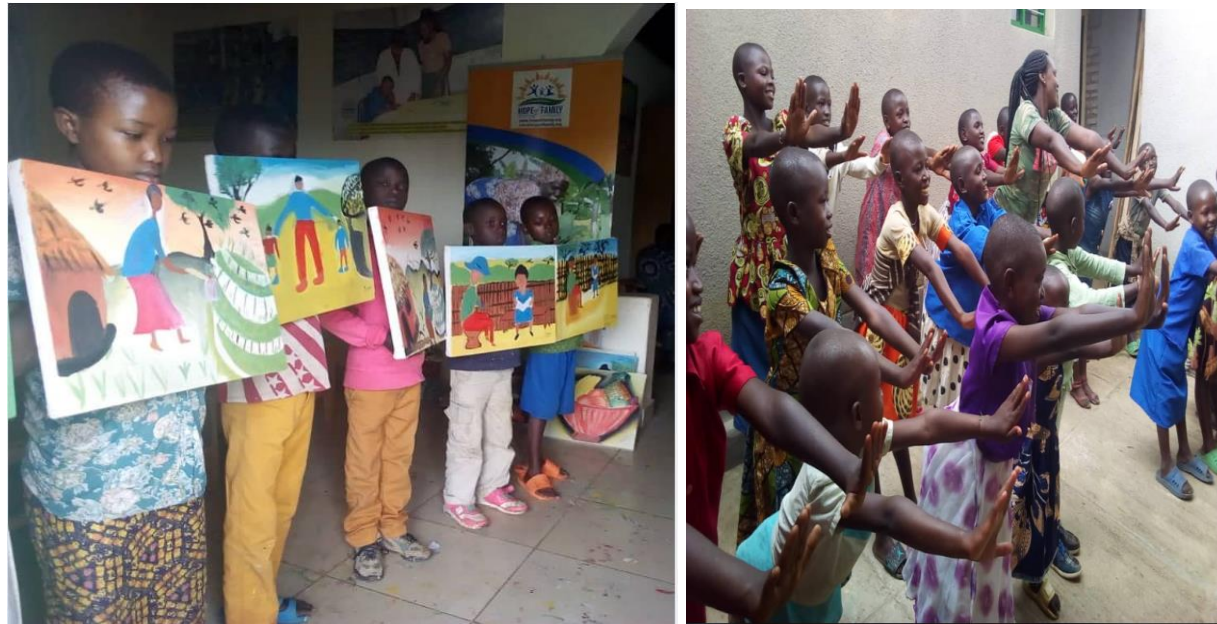
Figure 3: Children supported by Hope of Family attending talent detection sessions. There is also a football club, traditional dance and art. All these led by professional coaches hired and paid by the project.